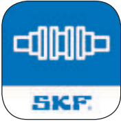
Spacer shaft app* Alignment of machines with spacer shafts