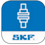
Vertical shaft app Alignment of machines with vertical shafts