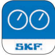
Values app* Use measuring heads like digital dial gauges