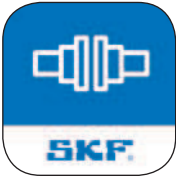
Shaft alignment app Alignment of machines with horizontal shafts