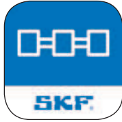
Machine train app* Alignment of machine trains