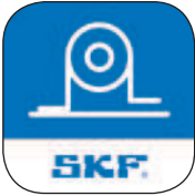
Soft foot app Identification and correction of soft foot